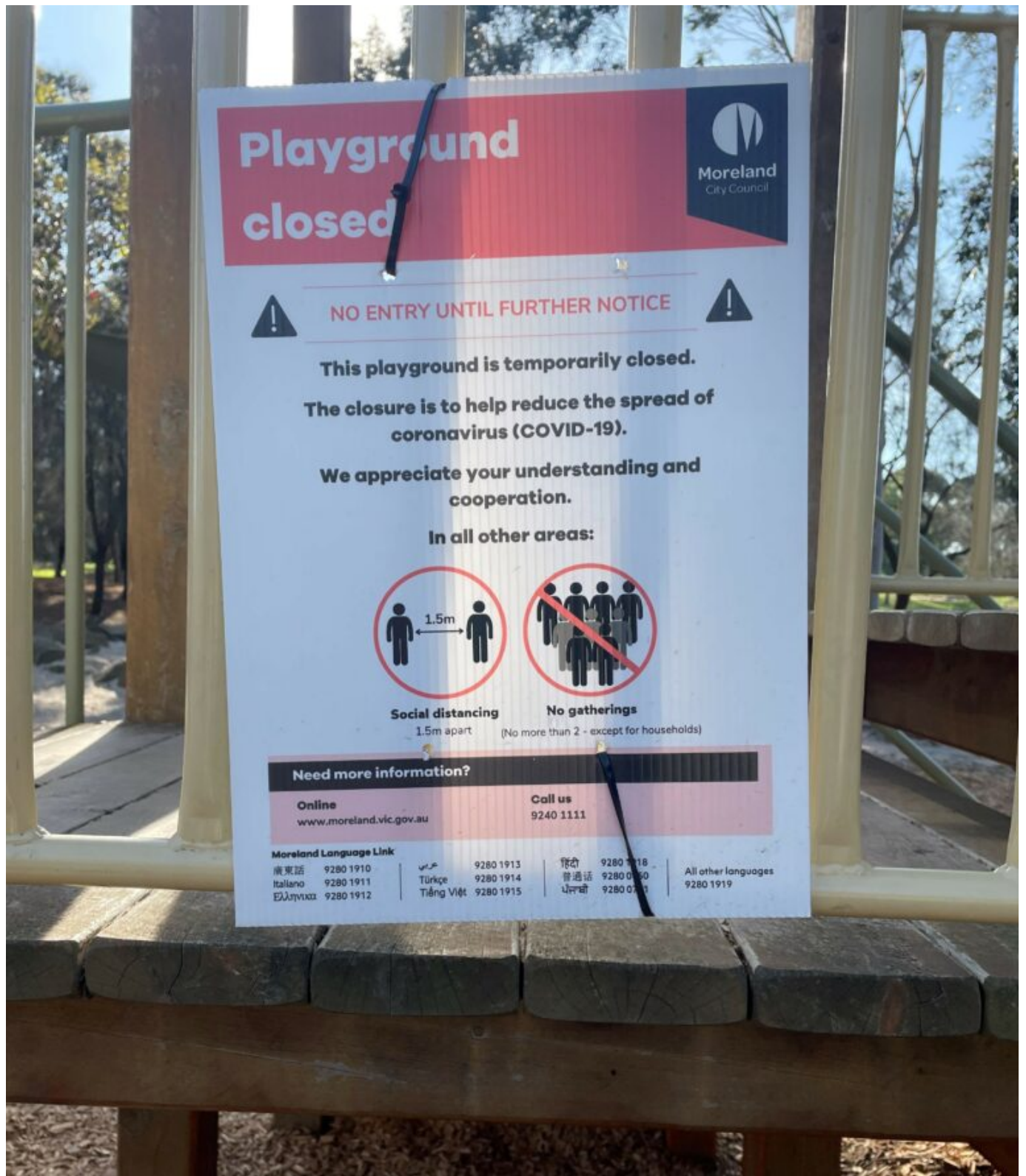
Playgrounds across the Australian state of Victoria were closed during some COVID-19 lockdown periods. Melbourne, August 2021.