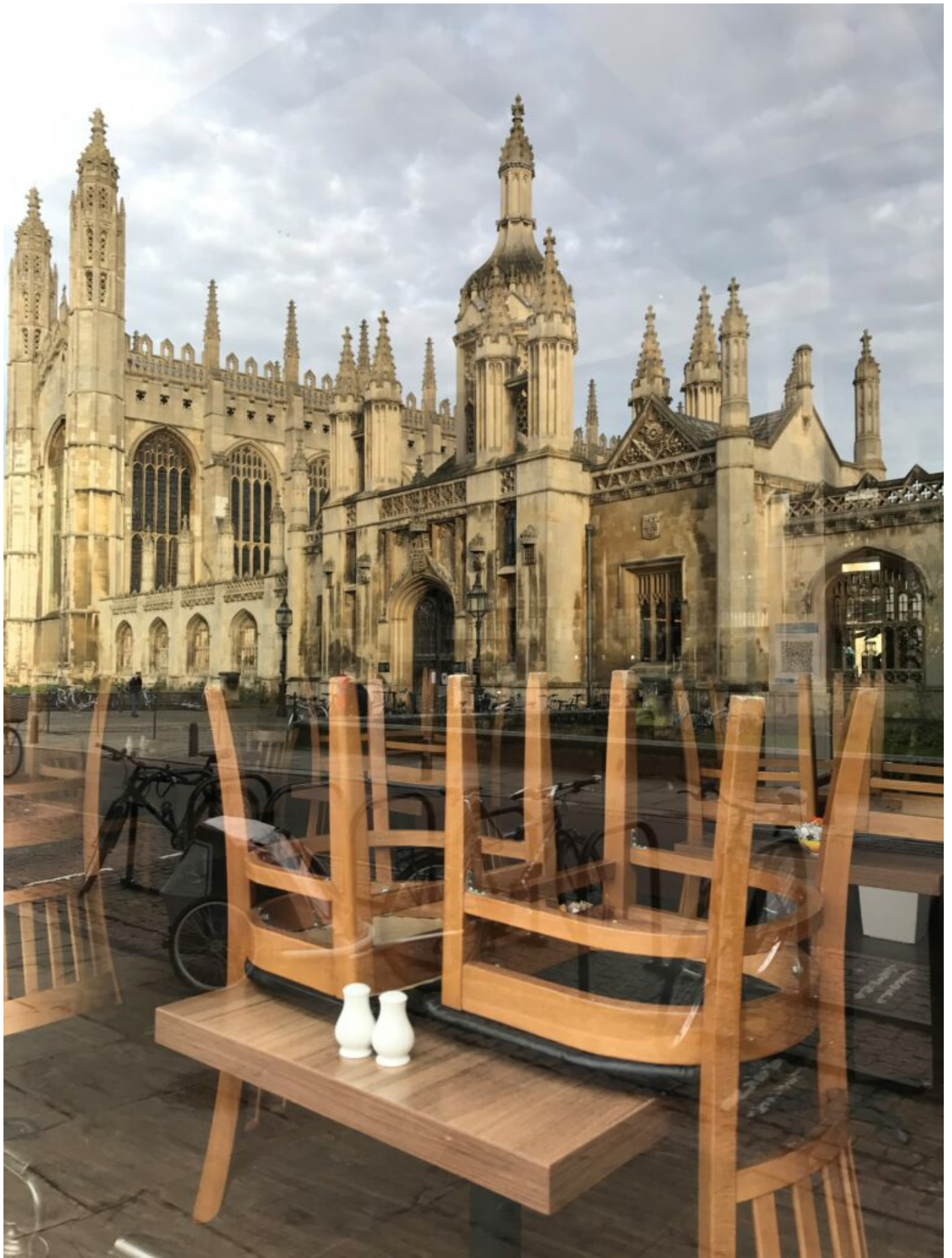
Reflection of King's College, Cambridge in window of the Copper Kettle restaurant closed due to COVID-19; Cambridge, England, November 2020.