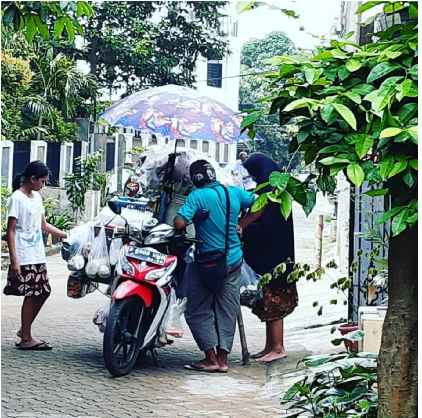
A mobile vegetable vendor delivering orders for food, stationery, and other household essentials in Jakarta.