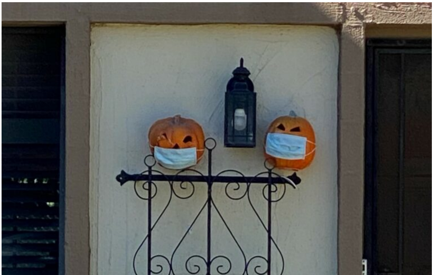
A Halloween display in Scottsdale, Arizona, where mask-wearing as a public health measure is controversial. Less than 60% of Arizona's population is