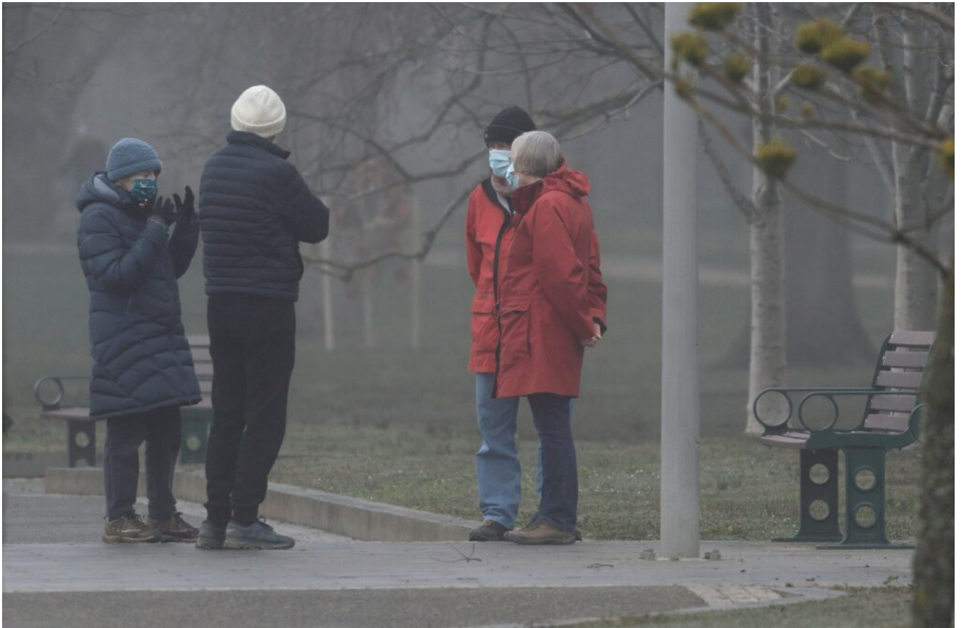
People wearing masks due to COVID-19 in the Australian town of Ballarat, August 2020.