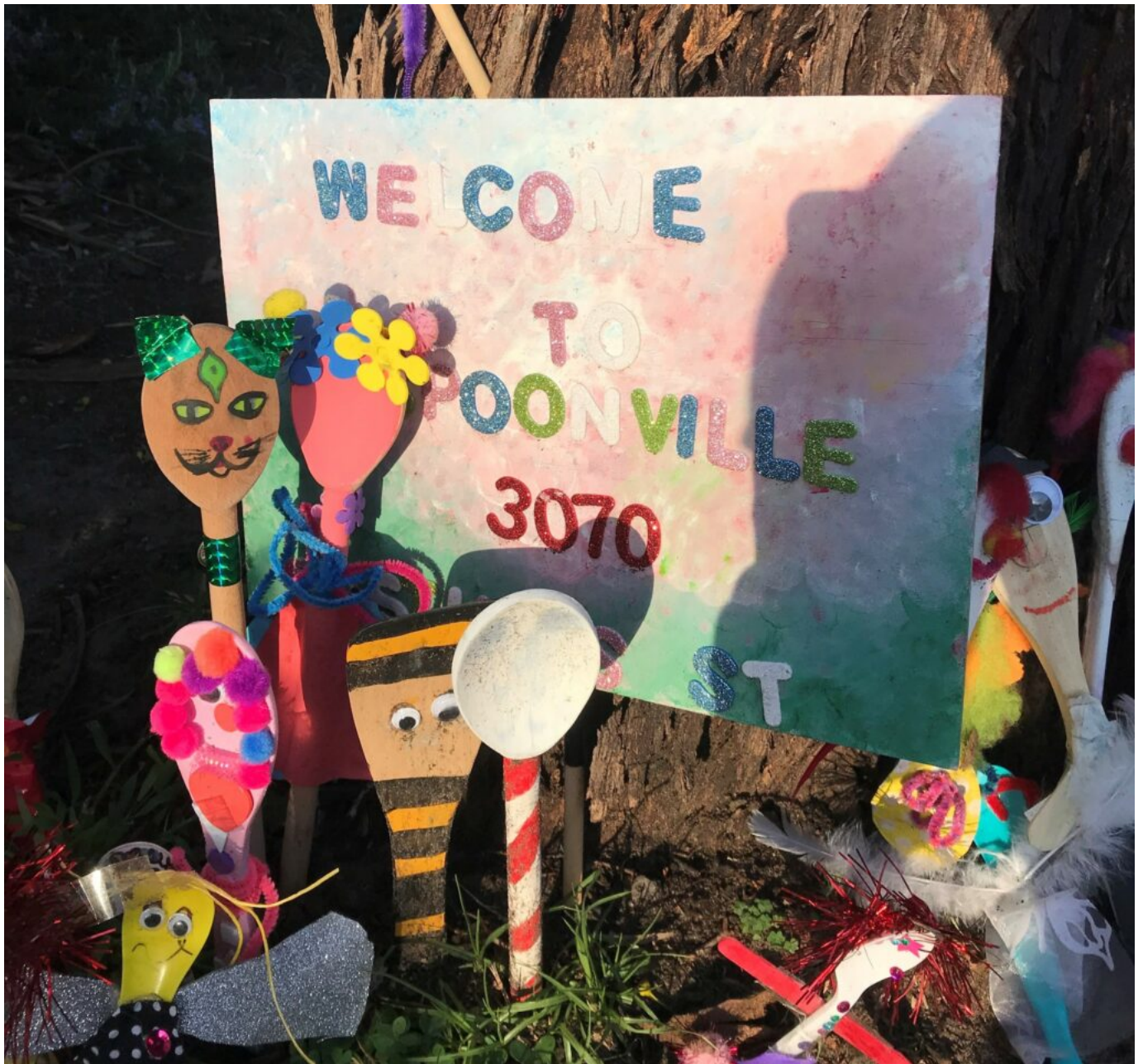
A 'Spoonville' village in Melbourne, 2020. Children across the city made 'spoon people' and placed them near footpaths and other public places.